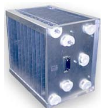
Electrostatic Precipitator Collection Plates